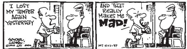
6 th SUNDAY IN ORDINARY TIME

"Again you have heard that it was said to your ancestors, Do not take a false oath, but make good to the Lord all that you vow. But I say to you, do not swear at all. Let your 'Yes' mean 'Yes' and your 'No' mean 'No.'" - Mt 5:33-34a, 37