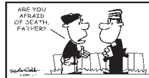
10TH SUNDAY IN ORDINARY TIME

PLEASE NOTE: The parish is looking for someone for housekeeping. Anyone interested in applying for this position, is asked to please submit a resume to the parish office, approximately 15 - 20 hours per week.