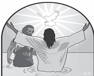
Baptism of the Lord

Parents must make arrangements for the Baptism of their child in advance at the parish office, and all necessary paperwork must be completed by the 1st week of the month. Parents and Sponsors must attend ONE instruction class in preparation for Baptism. Sponsors MUST be registered for (3) months and active in the parish; married in the Catholic Church; and be baptized and confirmed in the Catholic Church. Class instruction is on the 1ST SATURDAY of every month - 1:00 - 3:00 p.m. in the parish hall. Baptisms take place on the 3RD SUNDAY of every month.